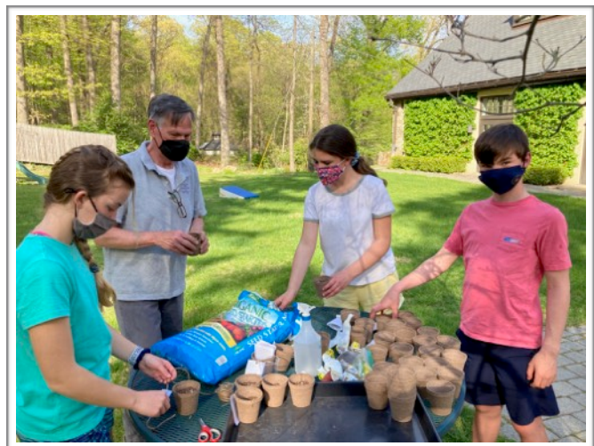
The Confirmation Class prepares seedlings that will soon be transferred to the Giving Garden at Ross Farms