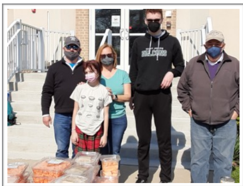
At the Somerville Food Bank